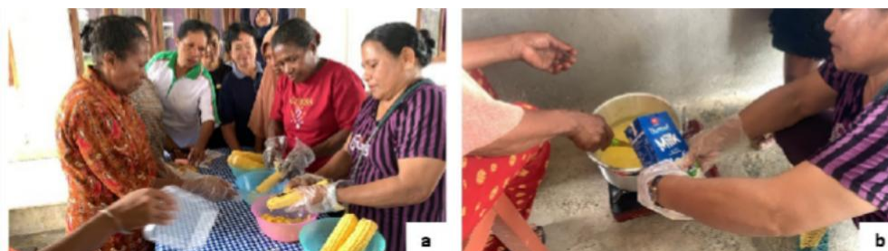
FIGURE 3. NEXT DEMONSTRATION OF CORN MILK PRODUCTION. (A) THE PROCESS OF SEPARATING CORN KERNELS FROM THE COB; (B) THE PROCESS OF COOKING CORN JUICE

the corn extract is filtered using a fine cloth, squeezed, and the corn juice is collected. Cook over medium heat while stirring for several minutes until foam or small bubbles appear in the solution (Figure 3).