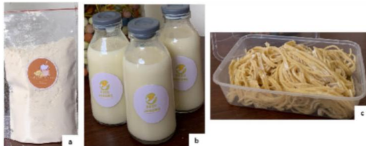
Figure 5. Processed corn products. (a) Corn flour; (b) Corn milk; (c) Corn noodles

The corn processing training provided new insights to the women in Warbo Village, Arso 7 District, Keerom Regency, especially in terms of diversifying corn food commodities. The achievement of this training activity is that the participants were able to create packaging and design creative and innovative corn product stickers (Figure 5).