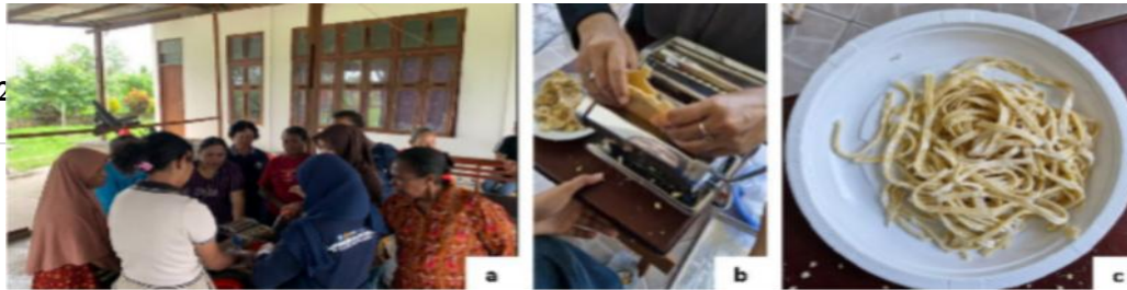
Figure 4. Demonstration Of Making Corn Noodles. (A) Participants Listening To An Explanation On How To Use The Noodle Press; (B) Noodle Dough Being Pressed And Rolled With The Noodle Press; (C) The Finished Corn Noodles.

These Findings Are Also Supported By The Study Of Eliasson And Gudmunsson (1996), Which Indicates That High Levels Of Soluble Amylose And High Granule Expansion Capacity Can Increase Elasticity. Conversely, High Levels Of Soluble Amylopectin Interfere With Gel Formation And Reduce Elasticity. This Demonstrates That The Degree Of Gelatinization Is A Critical Factor In Determining The Elongation Properties Of Noodles.