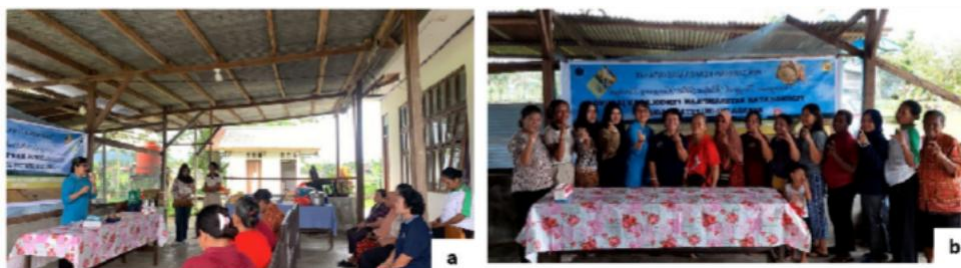
Figure 1. Community service activities. (a) Delivery of material; (b) Photos of training participants