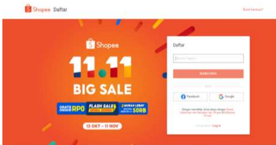
Figure 1. Stages of Account Creation on Shopee