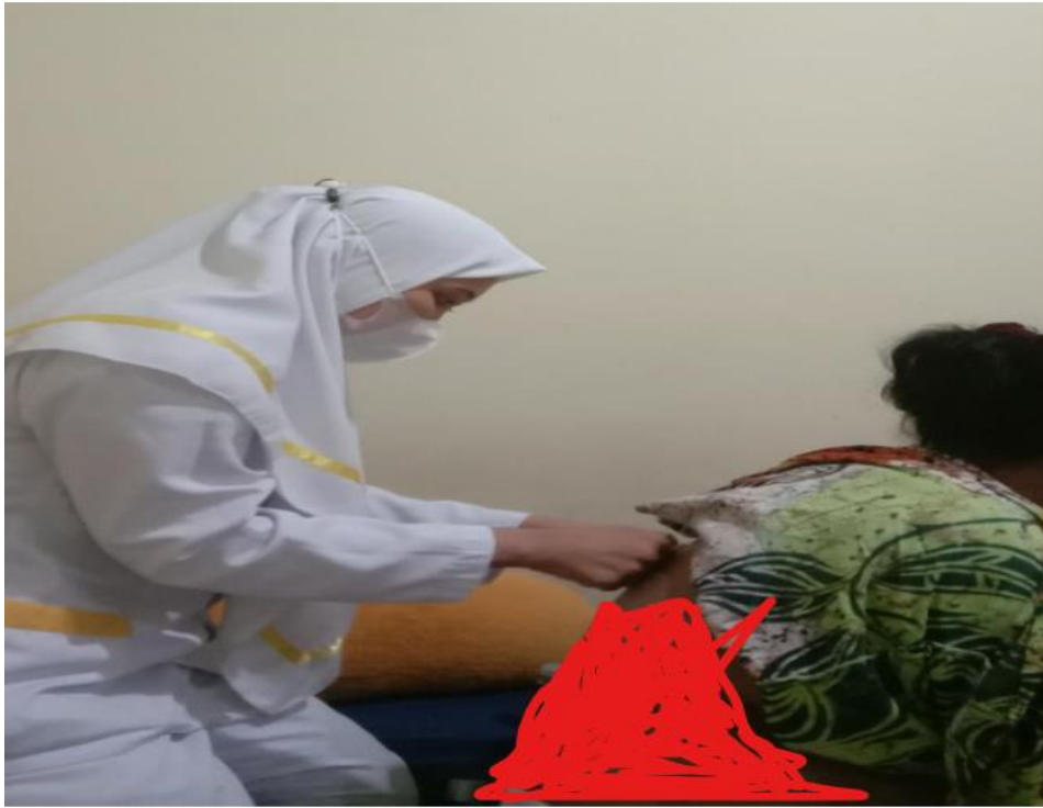
Figure 2. Oxytocin massage practice

Breastfeeding continuously can increase milk production. Empty breast conditions will stimulate the brain to produce the hormones oxytocin and prolactin to produce breast milk. Use of bottles or pacifiers on infants should be avoided. This can cause nipple confusion in the baby. The suckling of a baby who uses a bottle or pacifier will not be as strong as that of a baby who feeds on the mother's breast. By doing oxytocin massage, it can help increase milk production. This massage creates a sense of comfort for the mother so that the letdown reflex will stimulate the production of oxytocin. This oxytocin massage is done by doing massage along the mother's vertebrates. The team carried out the massage practice directly on the mother so that the nursing mother could feel it directly and could clearly feel the area to be massaged and how to massage it. In addition to oxytocin massage, mothers are also trained for breast care. One of the most common problems encountered by breastfeeding mothers is the presence of breast milk dams (engorgement). The dam is due to full breast milk production but not being breastfed/expressed. Breast care is done by massaging the breast area until the milk comes out. This technique can be done by breastfeeding mothers who want to express their milk but do not have a milking device. (11),(12),(13),(14)