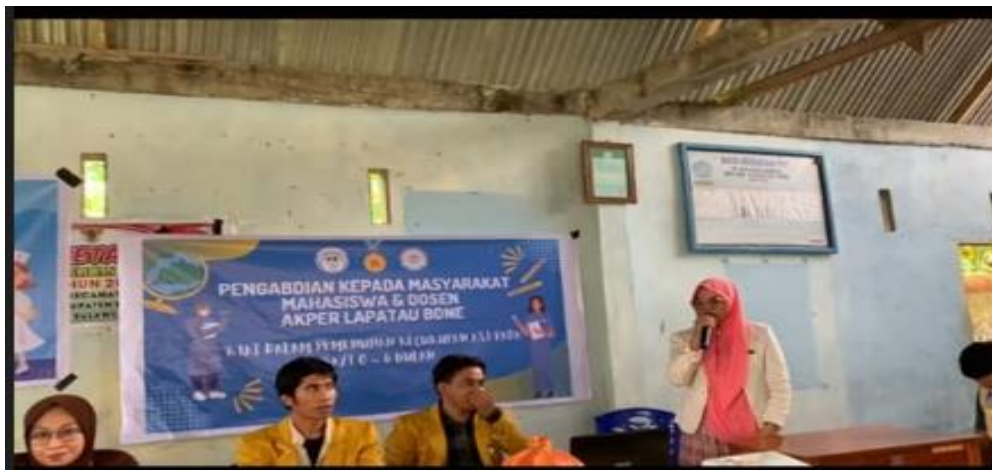
Figure 1. Counseling process

Community service activities regarding increasing the perception of breastfeeding mothers regarding the adequacy of breastfeeding with a long duration of operation are carried out for 2 consecutive days. At the beginning of this activity, the first thing to do was to ask the extent of the mother's knowledge about exclusive breastfeeding. Most of the mothers in this activity did not really understand about exclusive breastfeeding, which is breastfeeding for 6 months without providing any food or liquid other than breast milk except for vitamins or medicines given from the Public health center. After doing a common perception regarding exclusive breastfeeding, then the mother is then given an understanding of what is meant by adequate breastfeeding. In this activity, the speaker explains and describes the signs of adequacy of breast milk that can be seen and assessed from the condition of the baby. There are several signs of adequacy of breast milk in infants which include an increase in infant weight, infant elimination pattern (BAK/BAB), infant behavior during and after feeding. After providing an understanding of the adequacy of breastfeeding, then the presenters provide an understanding of how to increase milk production such as maternal rest patterns, nutritional intake, family support, and correct breastfeeding techniques.