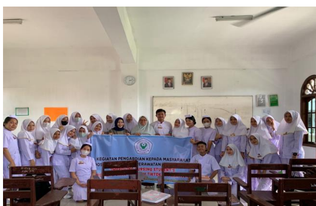
Picture 2. The Nursing Students and The Community Service Team