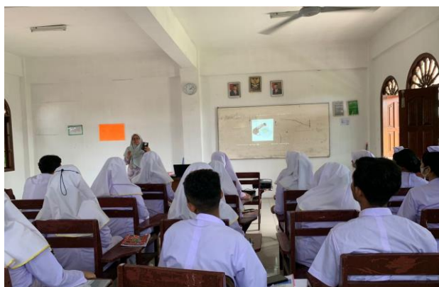
Picture 3. The Nursing Students' Respond when explaining about Medical Instruments and the Usage

The event was close by the leader of community service team by giving some souvenir to the participants. At the end of the activity, the team evaluated about the lack of the community service event about the duration of the time, the electric that suddenly off, and some medical instrument that missing. The big problems in this event were a few of the participants that would not imitate the practice of the pronunciation and they did not want to perform speaking skill performance in front of the class. So that we can evaluate how far that the TikTok video can increase the nursing students' speaking skill through TikTok Video compare to speaking in front of the class directly. The indicator of success of this event only could evaluate from the motivation the student showed when they perform speaking skill directly compare to when they perform speaking skill in TikTok Video. Those all were discussed so that the next event of community service we can minimize the problem and found the best solution.