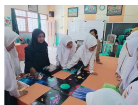
Figure 3. Application of Starbook Media (a) and Box Up Media (b)