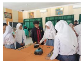
Figure 3. Application of Pop Up-Book (a) and Solar System Tool based Arduino(b)

Pre-test dan Post-test pada siswa dilakukan untuk mengukur efek dan pengetahuan serta pengaruh dari media yang telah dibuat terhadap siswa. Pelaksanaan Pre-test dilakukan sebelum diberikan penjelasan materi dan post-test dilaksanakan setelah penerapan media. Berdasarkan pre-test dan post-test didapatkan hasil N-Gain dan N-Gain persen sebagaimana pada Tabel 3 berikut.