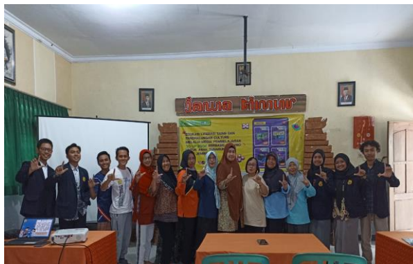
Figure 2. Documentation of Media Socialization Activities

The socialization and application of 3D up Book media activities were carried out for three days. The socialization of activities was held on September 15, 2023. This activity was attended by teachers at SLBN Jember. The purpose of this socialization activity is to introduce 3D Up Book media to teachers for learning science and Pandhalungan culture. At the socialization event, teachers were given a program guidebook containing the meaning and steps of using 3D Up Book media. This media socialization activity event was carried out by explaining the contents and how to use the 3D Up Book media. After giving an explanation of the material, discussion and question and answer activities were carried out related to the explanation of the 3D Up Book media that had been given. Teachers also filled out a response questionnaire for the 3D Up Book media which was used as data in this community service. Documentation of media socialization activities as shown in Figure 2 below.