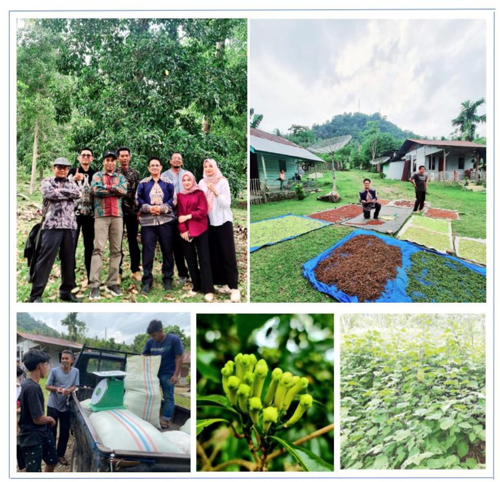
Figure 1. Field Analysis of Patchouli and Clove Area