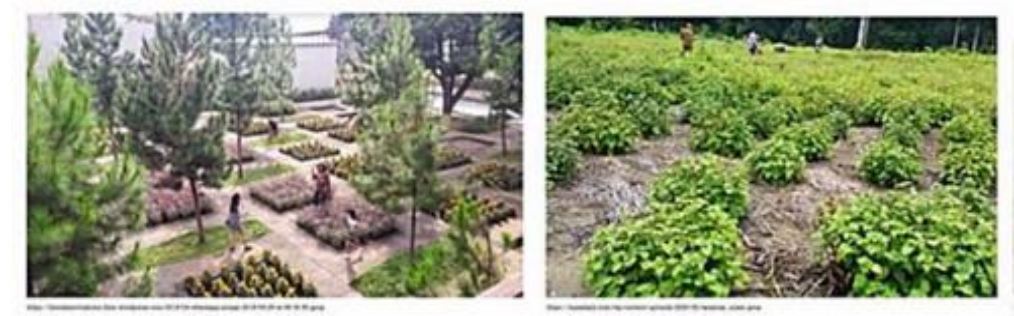
Figure 3. Patchouli Agro Area Potential

Tourism activities that will be implemented in the Agrotourism Area, Sabang City are divided based on tourist participation in agricultural activities (upstream and downstream), namely active activities and passive activities. Active activities are activities that involve tourists in agricultural activities (upstream and downstream) directly.