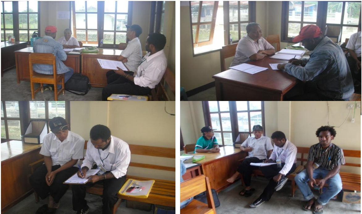
Figure 3. Financial Preparation Training Activities by Submitting Financial Reports on Paper to the Treasurer and Bamuskam.

To find out the activity output targets as in table 2 above is to carry out direct observations/observations on PKM objects and conduct interviews with the treasurer after the activity to assess the achievement of the contributions faced. This is also a form of evaluation and ongoing program with partners in the future.