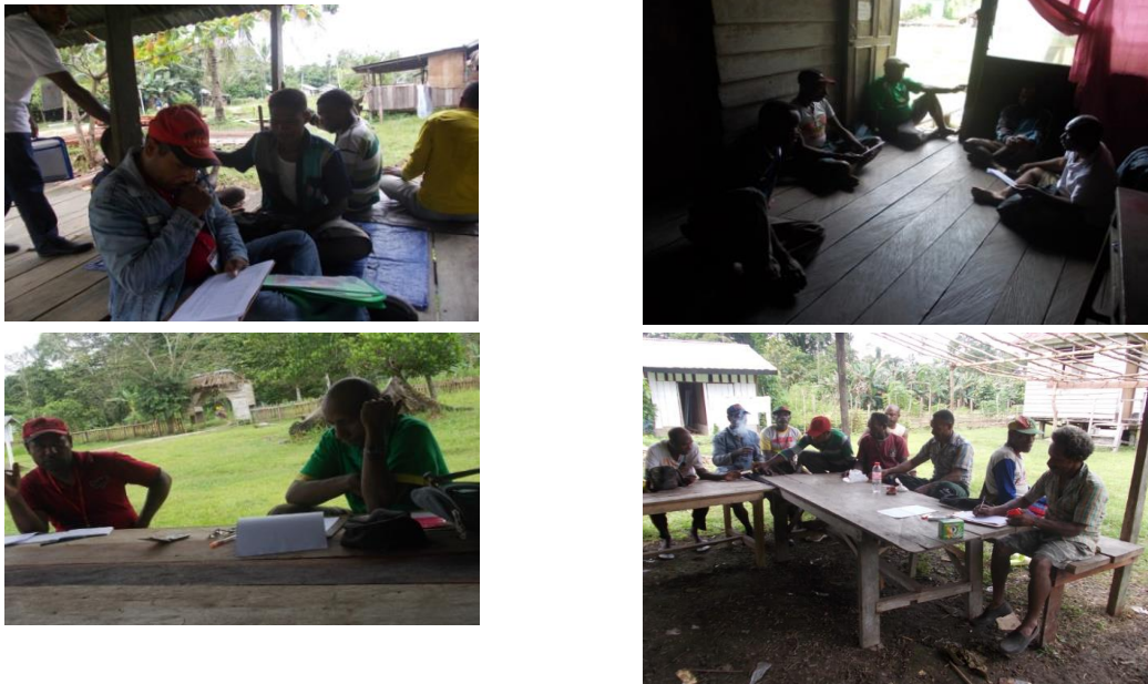
Figure 2. Financial Preparation Socialization and Training Activities Amyu Village Apparatus

After conducting socialization by presenting theoretical material, a team of lecturers with accounting expertise provided practical training on preparing financial reports in the East Arso District specifically for the treasurer and the Muskamkam, Amyu. This aims to train treasurers and security officials as financial managers of the Amyu Village apparatus directly in applying the knowledge that has been given as well as providing solutions to the problems of preparing financial reports currently faced by the Amyu Village Apparatus.