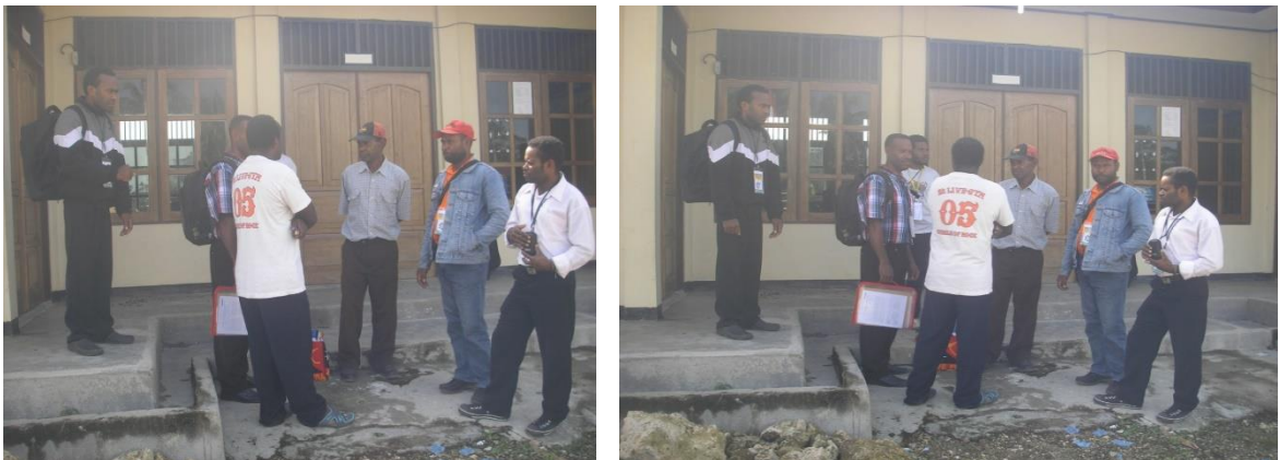
Figure 4. Easter Evaluation Visit for Second Stage Activities

To find out the activity output targets as in table 2 above is to carry out direct observations/observations on PKM objects and conduct interviews with the treasurer after the activity to assess the achievement of the contributions faced. This is also a form of evaluation and ongoing program with partners in the future.