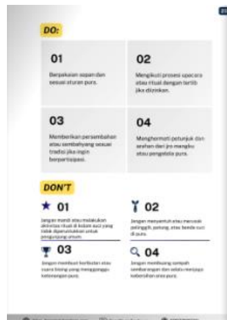
Figure 4. Design Guide Culture & Ethics Design Guide Culture & Ethics