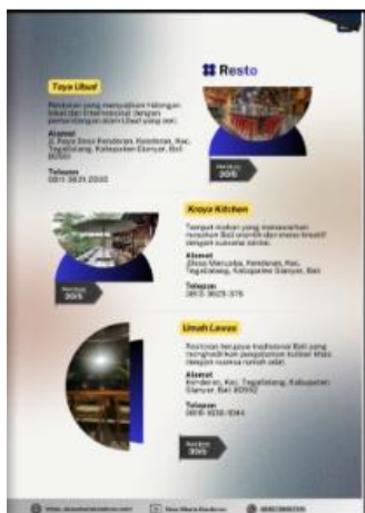
Figure 3. MSME & Local Economy Catalog Design

The next feature is a catalog of MSMEs and local economies, which serves as a digital directory to introduce culinary products, handicrafts, and local guide services to tourists. Each item is accompanied by contact information, making it easy for tourists to interact directly with the businesses. Furthermore, there is a cultural and ethical guide feature containing information on etiquette and rules that tourists should observe while in the village to preserve cultural values and avoid potential social conflict. The final feature is accessibility and practical information, which includes data on public facilities, emergency contacts, and the use of QR Code technology, which allows tourists to quickly access additional information at tourist destinations.