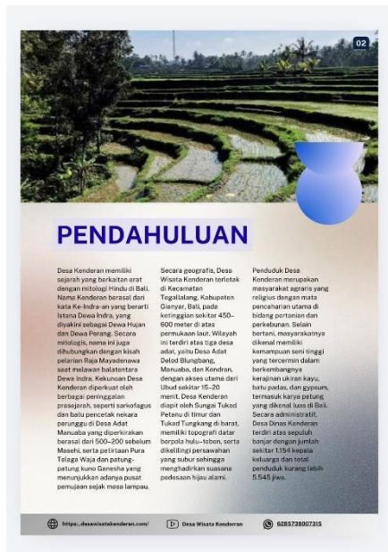
Figure 1. E-Guidebook Introduction Design

heritage. The presentation of information is supported by visualizations in the form of archived photos and current documentation that is packaged attractively. The second feature is an interactive map and trekking routes that provide access guides to tourist destinations, including paths to hidden gems such as waterfalls and rice fields, complete with estimated travel times and levels of difficulty of the routes.