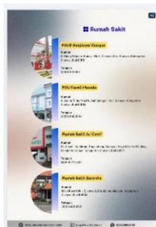
Figure 5. Accessibility Design & Practical Information

The Kenderan Village E-Guidebook serves as both a promotional medium and an effective knowledge transfer tool. Through structured information presentation, engaging visuals, and the integration of educational content, the e-Guidebook bridges tourists' understanding of the village's history, culture, and environment. Furthermore, integrating sustainability values into the content serves as a preventative measure for shaping more responsible tourist behavior. Thus, this e-Guidebook is expected to improve the quality of the tourism experience while supporting cultural and environmental preservation and the sustainable empowerment of local communities.