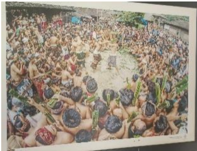
Figure 2. Mekare-kare ceremony