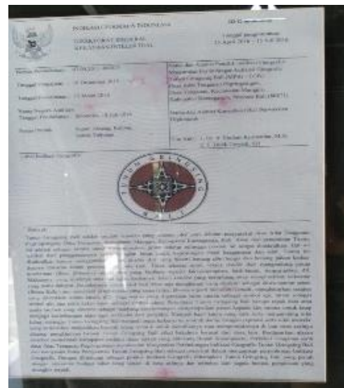
Figure 5. Indonesian Geographical Indications

In order to keep Wisdom Local alive, it requires support from the public owner of Wisdom Local, as well as the government, which is expected to follow as well as for responsible answers to keep Wisdom Local alive in the area. With policy and government strategy being one partner important support culture as well as wisdom local for its existence are still awake. Intervention government can hold and apply a number of instrument policies that can be used to control and deliver incentives to develop sustainable tourism.