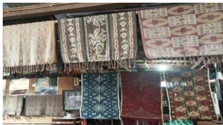
Figure 6. Gringsing cloth from Tenganan Pegringsingan Village

To know the existence of wisdom local in policy development tourism in the village quiet grinding Karangasem district, Bali province, the author used implementation Edward III's model policy to discuss how policy development tourism in the village quiet grinding was implemented. In policy development tourism, author Edward III's policy model was influenced by four factors, including communication, resources, disposition, and structure of bureaucracy.