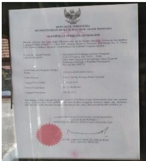
Figure 4. Gringsing Weaving IPR