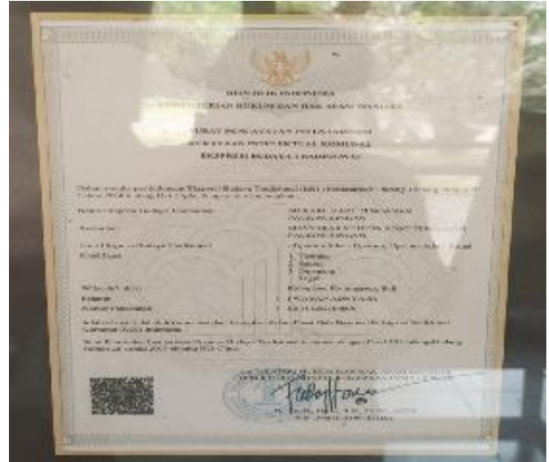
Figure 3. Mekare-kare IPR

In the village, relax grinding, there is a ceremony that became characteristic of the typical village; one of them is blossome-kare, or more known as the "Pandan War.". Mekare-kare is part of the peak of the procession suite ceremony Ngusaba Sambah, which is held every time.