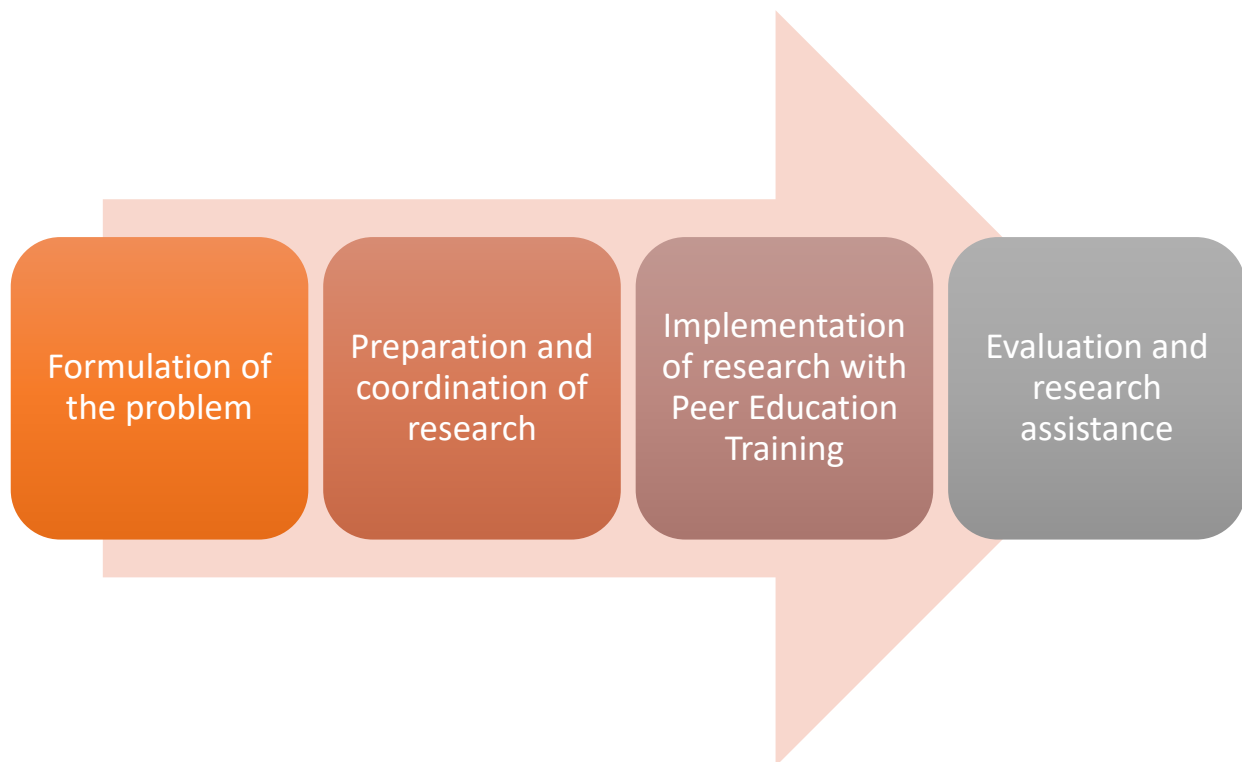
Graph 1. Research Timeline

evaluate skills participants, teams have to make sheet evaluations where participants have requested For practice counseling, peer.