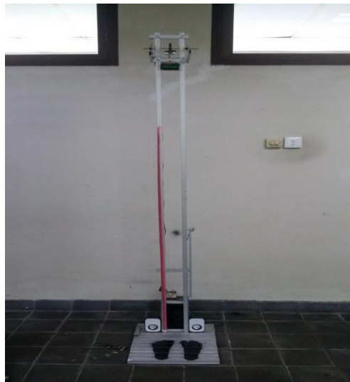
Figure 3 . Tool Measuring Tall Body Automatic for component explanation could viewed on table

Device gauge tall body based on microcontroller this using the HCSR-04 ping sensor which will basically function as a reader sensor distance. Data in the form of writing will in show on LCD which could move follow tall object and data in the form of voice which there is on SD Card output to the speaker. These components can be seen in picture under.