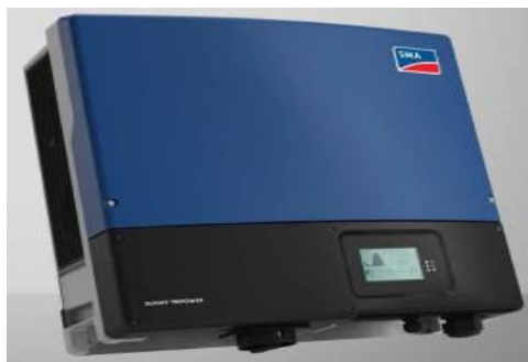
Figure 2. Inverter SMA Sunny Tripower 20000 W.

Brand : SMA INPUT Max. DC Power : 20440 W MPP voltage range / rated input voltage : 380 V to 800 V /600 V Min. input voltage /start input : 150 V / 188 VMax voltage Max. input Current input A / Input B : 33 A / 33 A OUTPUT Rated power (at 230 V, 50 Hz) : 20000 W Max. air conditioning apparent : 20000 VA power Max. efficiency / European : 98.4 % / 98.0 % Efficiency