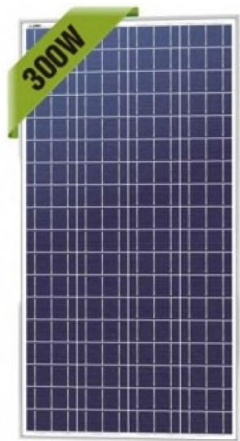
Image 1. Panel Sun Shinyoku polycrystalline 300 WP

Inverter In planning this, used inverter which already there is in market, and already certified for easy equipment selection. Inverter used is a SMA brand inverter with a power of 20 kW. Below is the inverter specification the.